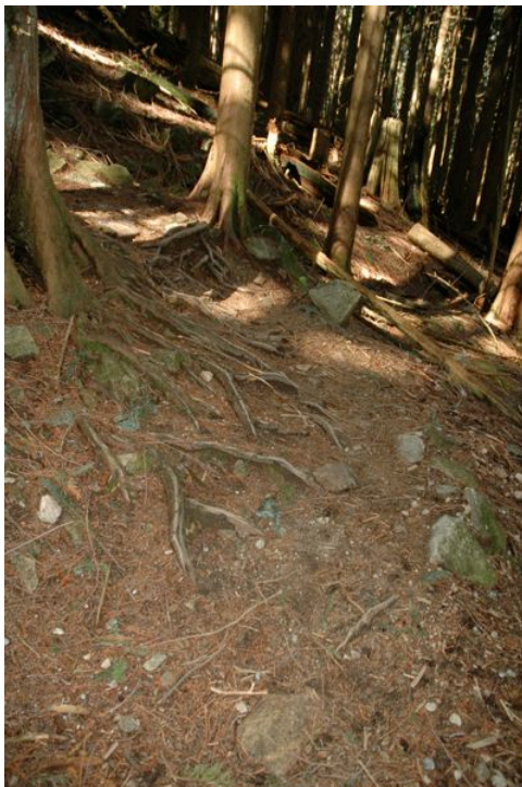
This corner will be raised at the bottom and slightly banked, with the roots covered.