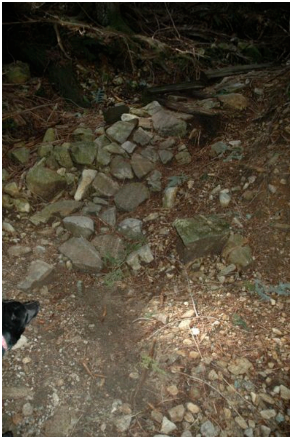
This corner will redone so it's smoother and not as steep.