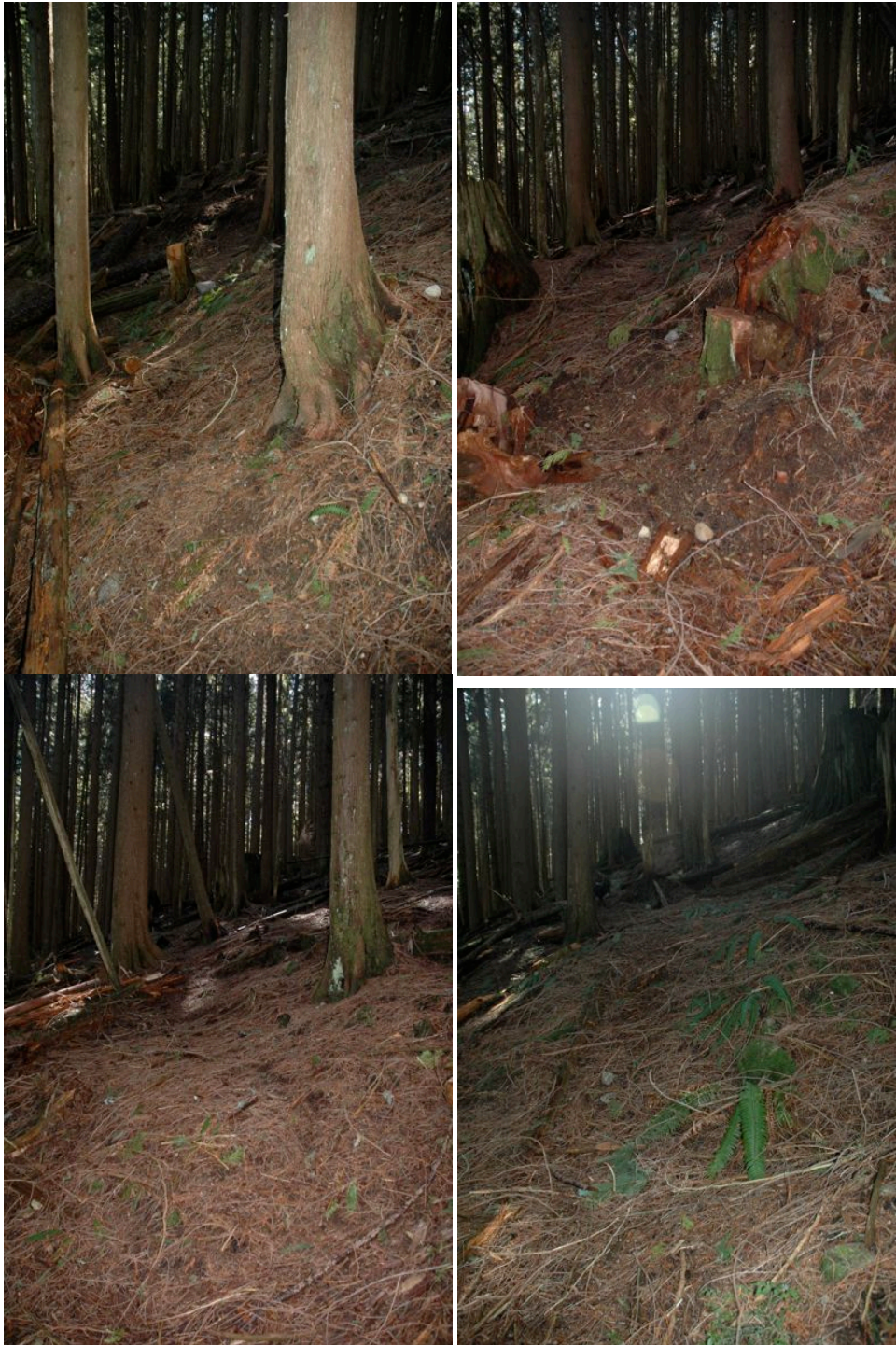
Sequence of photos shows bypass route