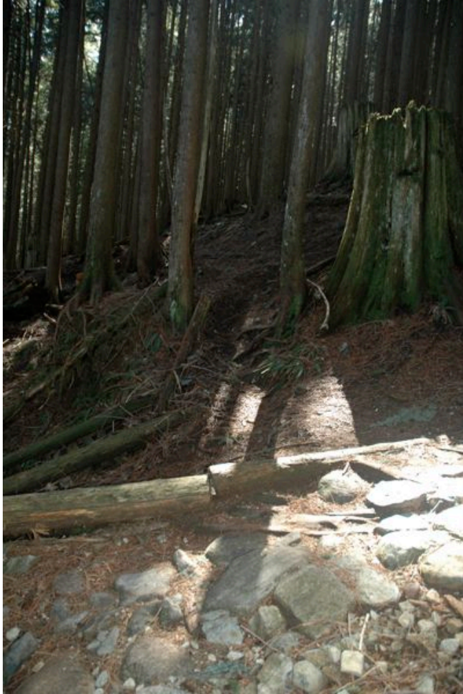
Starting point of bypass. Bypass will head straight through trees (center of photo).